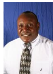
All Done Notary Gulfport, MS